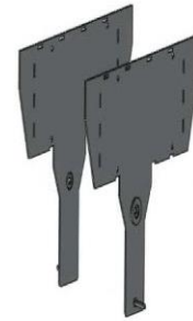
Camera Lens Casing Components